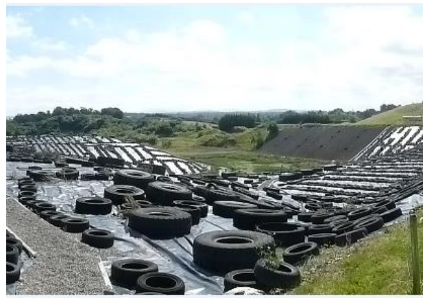
Tyres currently holding down the temporary capping system

Leachate is the largest waste currently generated from the site, with small amounts of other wastes associated with the site offices and security huts and waste tyres currently in use as weighting on the temporary capping system in the lined landfill cell currently on site.