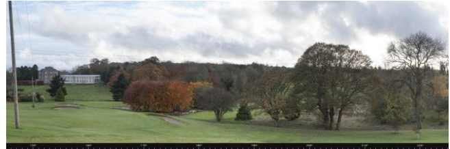
View point looking towards the proposed Project site from Palmerstown House Estate

The site lies within the Landscape Character Area (LCA) 'Northern lowlands – Naas and environs'. This LCA is characterised by agricultural lands, small settlements and some commercial activity. There are no landscape designations relevant to the land at the site. The LCA has low sensitivity to change and has the ability to accommodate development.