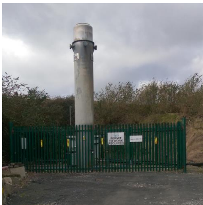
The Existing Landfill Gas Flare

An assessment of the impact of the proposed Project on air quality and odour was undertaken which focused on key pollutants emitted from landfill sites which includes landfill gases, combustion gases from the landfill gas flare and vehicles and dust from remediation works and movement of vehicles.