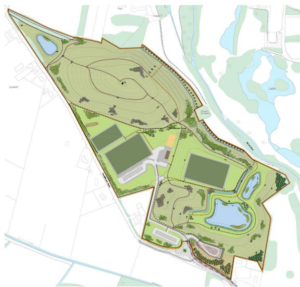
Proposed Project Landscape Masterplan

Once the Remediation Phase is complete, the site will be a multi-use public park including playing pitches, changing rooms, a playground, walking paths, and vehicle and bicycle parking. Landfill management infrastructure will continue to protect the environment, resulting in environmental benefits both on and off site.