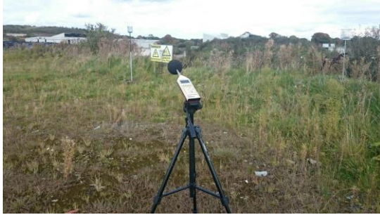
Noise Monitoring at the site

A number of measures to reduce and limit noise during the Remediation Phase will be undertaken including the selection of noise controls such as acoustic screens and barriers and equipment enclosures. Noise monitoring will also be undertaken during the Remediation Phase to monitor compliance with required noise limits.