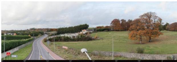
Photomontage of the view along L2005 with proposed improved access arrangements

Overall there will be a permanent significant positive impact associated with the improvements to the site access and associated realignment of the L2005 Kerdiffstown Road.