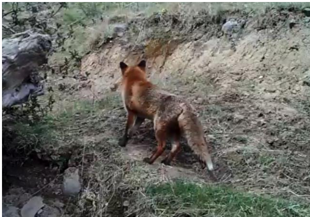
Fox at the landfill site

With regards to protected species, two badger setts were identified during field surveys and bat roosts and bat activity was also recorded on site during bat surveys. There were 38 species of breeding bird recorded during the breeding bird surveys. Habitats at the site generally comprised dry meadows and grassy verges and scrub. The site was dominated by tree lines, scrub, grassland and occasional hedgerow.