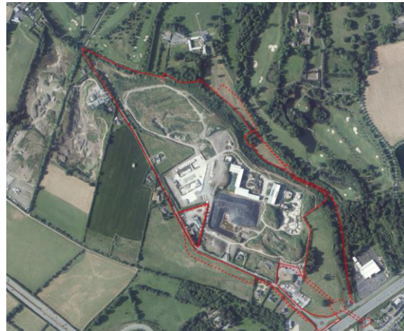
Kerdiffstown Landfill Remediation Project - Site Extents

The facility at Kerdiffstown was operated under a local authority waste permit followed by a waste licence, issued by the Environmental Protection Agency (EPA) in 2003; with a revised licence issued in 2006. The site consisted of an extensive recycling facility, a lined landfill cell, which had been partially filled with waste, and large unlined areas of the site in which substantial quantities of waste have been deposited. There are also smaller quantities of waste stockpiled around the site. The presence of such large quantities of waste and the lack of appropriate infrastructure to manage pollution arising from this waste, results in the potential for environmental pollution to occur.